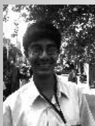
HARSHAVARDHAN (Best Supporting Actor)