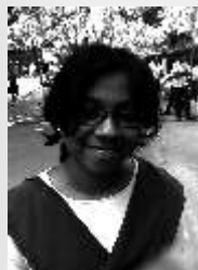
RADHA (Best Director & Best Music Director)